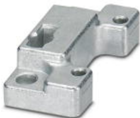
Panel mounting flange for HEAVYCON ADVANCE TMB housing with bayonet locking

Please be informed that the data shown in this PDF Document is generated from our Online Catalog. Please find the complete data in the user's documentation. Our General Terms of Use for Downloads are valid ( http://phoenixcontact.com/download )