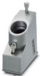
Aluminum die-cast sleeve housing, with grommet, locking screws with knurled head, for a metric M32 cable gland, angled cable outlet, type VC3

Please be informed that the data shown in this PDF Document is generated from our Online Catalog. Please find the complete data in the user's documentation. Our General Terms of Use for Downloads are valid ( http://phoenixcontact.com/download )