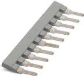
Insertion bridge, Number of positions: 10, Color: gray

Please be informed that the data shown in this PDF Document is generated from our Online Catalog. Please find the complete data in the user's documentation. Our General Terms of Use for Downloads are valid ( http://phoenixcontact.com/download )