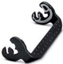
Replacement plastic single locking latch for standard housings of type B24

Please be informed that the data shown in this PDF Document is generated from our Online Catalog. Please find the complete data in the user's documentation. Our General Terms of Use for Downloads are valid ( http://phoenixcontact.com/download )