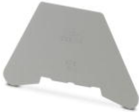
Partition plate, Color: gray

Please be informed that the data shown in this PDF Document is generated from our Online Catalog. Please find the complete data in the user's documentation. Our General Terms of Use for Downloads are valid ( http://phoenixcontact.com/download )