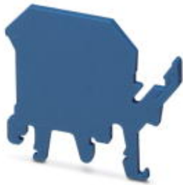
Support bracket, Number of positions: 1, Width: 2 mm, Color: blue

Please be informed that the data shown in this PDF Document is generated from our Online Catalog. Please find the complete data in the user's documentation. Our General Terms of Use for Downloads are valid ( http://phoenixcontact.com/download )