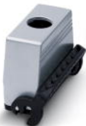
HEAVYCON coupling housing B24, with single locking latch, height 80 mm, with thread 1x M32

Please be informed that the data shown in this PDF Document is generated from our Online Catalog. Please find the complete data in the user's documentation. Our General Terms of Use for Downloads are valid ( http://phoenixcontact.com/download )