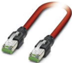
Sercos III patch cable, shielded, star quad, AWG 22 stranded (7-wire), RAL 3020 (traffic red), RJ45 plug/IP 20, straight, to RJ45 plug/IP20, straight, length: 1.0 m

Please be informed that the data shown in this PDF Document is generated from our Online Catalog. Please find the complete data in the user's documentation. Our General Terms of Use for Downloads are valid ( http://phoenixcontact.com/download )