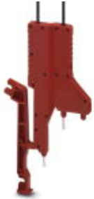
Test plugs, Color: red

Please be informed that the data shown in this PDF Document is generated from our Online Catalog. Please find the complete data in the user's documentation. Our General Terms of Use for Downloads are valid ( http://phoenixcontact.com/download )