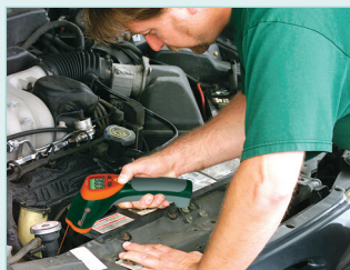
Measure non-contact surface temperature on automotive applications