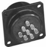
PT Solder wall mount receptacle