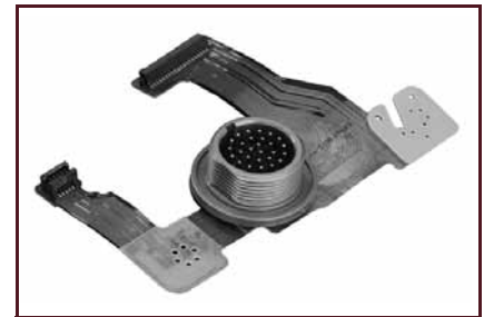
26482 Connector with Flex