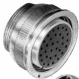
PC Threaded Crimp straight plug and wall mount receptacle