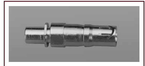
Socket Crimp Coax Contact for use in Miniature Crimp SE Type Connectors