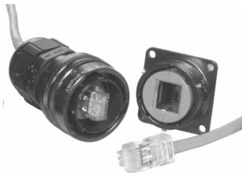
RJ Field Bayonet MIL-C-26482 Cylindricals