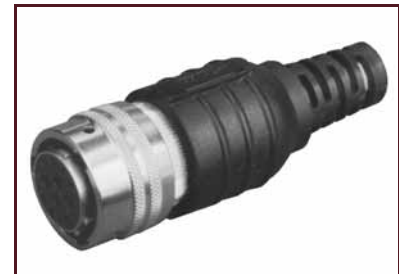
26482 Connector with Overmolded Cable