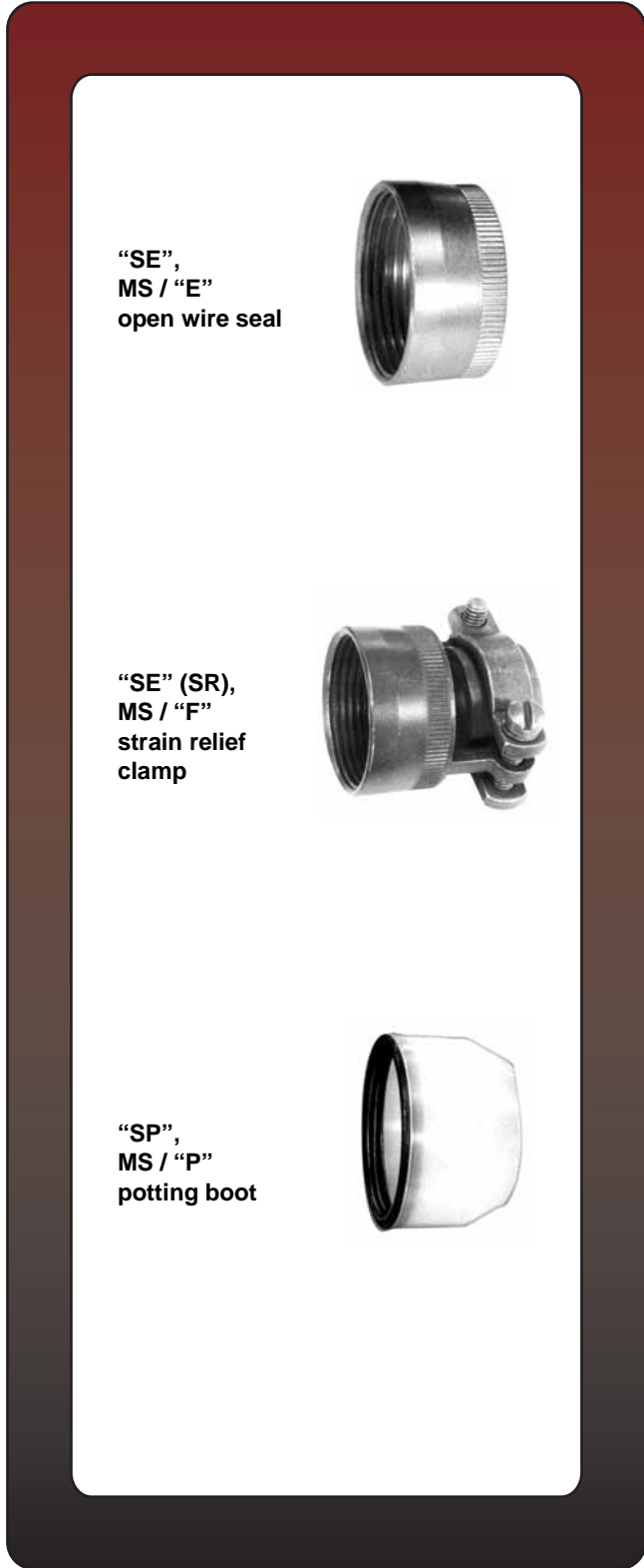
“SE”, MS / “E” open wire seal