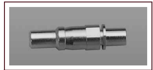
Pin Crimp Coax Contact for use in Miniature Crimp SE Type Connectors