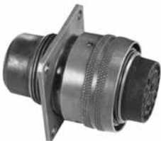
PT-SE Crimp wall mount receptacle and mated straight plug