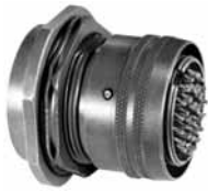
PT Solder jam nut receptacle and mated straight plug