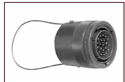
Breakaway Twist Pull 26482