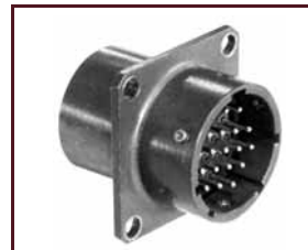
26482 Connector with EMI Filter Protection