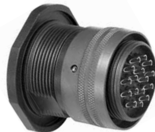
Geophysical Miniature Cylindricals