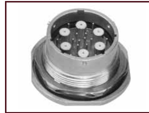
26482 Connector with Hermetic Seal Insert and Coax Contacts

Overmold seals and cables can be designed for almost any industrial application. A variety of materials are available: neoprene, hypalon and others; and a variety of lengths can be designed to meet customer specifications. Overmold seals to the rear of the connector and to the cable jacket providing moisture sealing.