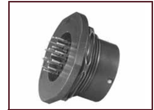
26482 Connector with PC Tail Contacts