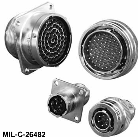
MIL-C-26482 Series 2