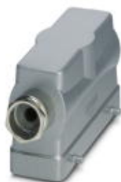
HEAVYCON B24 sleeve housing, for double locking latch, height: 76 mm, with 1 x Pg29 screw connection, lateral cable outlet

Please be informed that the data shown in this PDF Document is generated from our Online Catalog. Please find the complete data in the user's documentation. Our General Terms of Use for Downloads are valid ( http://phoenixcontact.com/download )