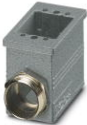
Coupling housing, made of metal, powder-coated type 1, number of modules 2, cable screw connection Pg16

Please be informed that the data shown in this PDF Document is generated from our Online Catalog. Please find the complete data in the user's documentation. Our General Terms of Use for Downloads are valid ( http://phoenixcontact.com/download )