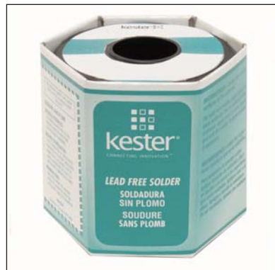
"275" No-Clean Core 1 lb. with K100LD