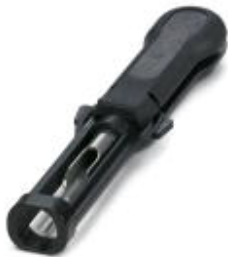
Contact removal tool, for turned CK 2,5... contacts

Please be informed that the data shown in this PDF Document is generated from our Online Catalog. Please find the complete data in the user's documentation. Our General Terms of Use for Downloads are valid ( http://phoenixcontact.com/download )