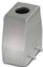
HEAVYCON sleeve housing B10, for double locking latch, height 72 mm, with thread 1x M25, straight conductor exit

Please be informed that the data shown in this PDF Document is generated from our Online Catalog. Please find the complete data in the user's documentation. Our General Terms of Use for Downloads are valid ( http://phoenixcontact.com/download )