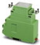
Replacement shield point, for INTERBUS-ST bus terminal block BKM-...

Shield connection clip - IBS RB-SHIELD - 2722742