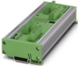
Coupling module (gateway), I/O coupling module for two INTERBUS systems, 24 V DC, IP20 protection, with MINI-COMBICON remote bus connection

Please be informed that the data shown in this PDF Document is generated from our Online Catalog. Please find the complete data in the user's documentation. Our General Terms of Use for Downloads are valid ( http://phoenixcontact.com/download )