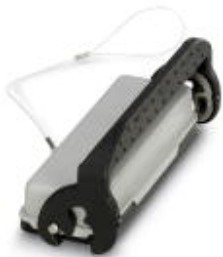
HEAVYCON protective cover, type B24, for sleeve housing without single locking latch, with retaining cord, IP54

Please be informed that the data shown in this PDF Document is generated from our Online Catalog. Please find the complete data in the user's documentation. Our General Terms of Use for Downloads are valid ( http://phoenixcontact.com/download )