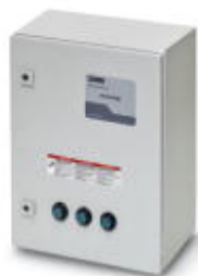
Indoor/outdoor lightning current arrester and TVSS system for 120/208-240 V

Please be informed that the data shown in this PDF Document is generated from our Online Catalog. Please find the complete data in the user's documentation. Our General Terms of Use for Downloads are valid ( http://phoenixcontact.com/download )