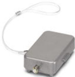
HEAVYCON protective cover, type B10, for supporting base element with single locking latch, with retaining cord, IP65, ALU

Please be informed that the data shown in this PDF Document is generated from our Online Catalog. Please find the complete data in the user's documentation. Our General Terms of Use for Downloads are valid ( http://phoenixcontact.com/download )