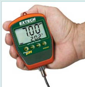
PH220-C includes pH electrode with 39" (1m) cable