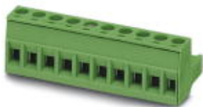
The figure shows a 10-pos. version of the product in green

PCB connector, nominal current: 12 A, number of positions: 2, pitch: 5 mm, connection method: Screw connection with tension sleeve, color: green, contact surface: Tin