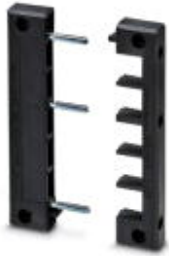
Sealing frame, length: 147 mm, width: 58 mm, height: 17 mm, color: black

Please be informed that the data shown in this PDF Document is generated from our Online Catalog. Please find the complete data in the user's documentation. Our General Terms of Use for Downloads are valid ( http://phoenixcontact.com/download )