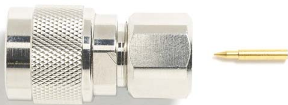
Model 73051 N Type Plug, 50 Ohm, Clamp Type, RG8, 213