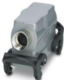
HEAVYCON B10 sleeve housing, with double locking latch, height: 56 mm, with 1 x M20 gland, lateral cable outlet

Please be informed that the data shown in this PDF Document is generated from our Online Catalog. Please find the complete data in the user's documentation. Our General Terms of Use for Downloads are valid ( http://phoenixcontact.com/download )