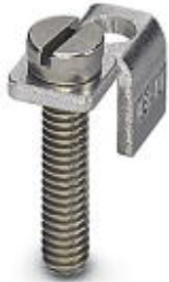
Chain bridge, Number of positions: 1, Color: silver

Please be informed that the data shown in this PDF Document is generated from our Online Catalog. Please find the complete data in the user's documentation. Our General Terms of Use for Downloads are valid ( http://phoenixcontact.com/download )