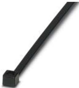
Cable binders for quick and secure bundling, standard version

Please be informed that the data shown in this PDF Document is generated from our Online Catalog. Please find the complete data in the user's documentation. Our General Terms of Use for Downloads are valid ( http://phoenixcontact.com/download )