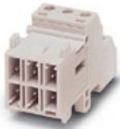
Contact insert module, for panel mounting frames, with screw connection, 5-pos. + PE connection, 250 V / 10 A

Please be informed that the data shown in this PDF Document is generated from our Online Catalog. Please find the complete data in the user's documentation. Our General Terms of Use for Downloads are valid ( http://phoenixcontact.com/download )