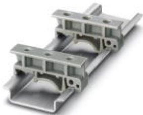
Rail adapters, for M3 screws, Length: 42.6 mm, Width: 10 mm, Height: 19 mm, Color: gray

Please be informed that the data shown in this PDF Document is generated from our Online Catalog. Please find the complete data in the user's documentation. Our General Terms of Use for Downloads are valid ( http://phoenixcontact.com/download )