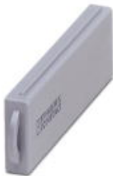
VARIOCON dust cover for panel mounting frame, with IP40 protection, type 2

Please be informed that the data shown in this PDF Document is generated from our Online Catalog. Please find the complete data in the user's documentation. Our General Terms of Use for Downloads are valid ( http://phoenixcontact.com/download )