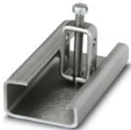
End clamp, width: 8 mm

Please be informed that the data shown in this PDF Document is generated from our Online Catalog. Please find the complete data in the user's documentation. Our General Terms of Use for Downloads are valid ( http://phoenixcontact.com/download )