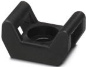
Cable binder base, for cable binders up to 9 mm wide, screwable, 5 mm fixing hole, 2-sided cable binder feed-through

Please be informed that the data shown in this PDF Document is generated from our Online Catalog. Please find the complete data in the user's documentation. Our General Terms of Use for Downloads are valid ( http://phoenixcontact.com/download )