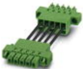
Spare local bus cable, for INTERBUS-ST modules