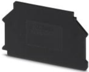
End cover, length: 58 mm, width: 2.2 mm, height: 35.05 mm, color: black

Please be informed that the data shown in this PDF Document is generated from our Online Catalog. Please find the complete data in the user's documentation. Our General Terms of Use for Downloads are valid ( http://phoenixcontact.com/download )