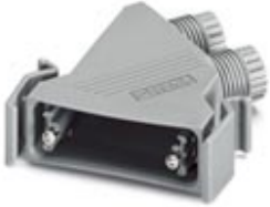
D-SUB sleeve housing, shell size 3, IP67 degree of protection

Please be informed that the data shown in this PDF Document is generated from our Online Catalog. Please find the complete data in the user's documentation. Our General Terms of Use for Downloads are valid ( http://phoenixcontact.com/download )