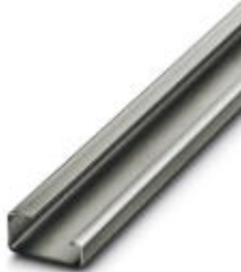
G-profile DIN rail, material: Steel, unperforated, height 15 mm, width 32 mm, length 2 m

Please be informed that the data shown in this PDF Document is generated from our Online Catalog. Please find the complete data in the user's documentation. Our General Terms of Use for Downloads are valid ( http://phoenixcontact.com/download )