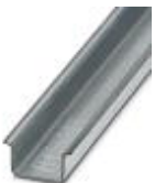
DIN rail, material: Galvanized, unperforated, height 15 mm, width 35 mm, length: 2 m

DIN rail, unperforated - NS 35/15 ZN UNPERF 2000MM - 1206586