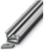
DIN rail, deep drawn, high profile, unperforated, 1.5 mm thick, material: aluminum, height 15 mm, width 35 mm, length 2000 mm

DIN rail, unperforated - NS 35/15 AL UNPERF 2000MM - 1201756