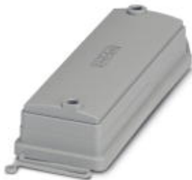
Protective cover B24, Clip locking, Protective cover material: PA, With lanyard

Please be informed that the data shown in this PDF Document is generated from our Online Catalog. Please find the complete data in the user's documentation. Our General Terms of Use for Downloads are valid ( http://phoenixcontact.com/download )