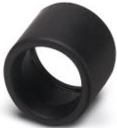
Seal, outside, to increase the protection type, size Pg16

Please be informed that the data shown in this PDF Document is generated from our Online Catalog. Please find the complete data in the user's documentation. Our General Terms of Use for Downloads are valid ( http://phoenixcontact.com/download )