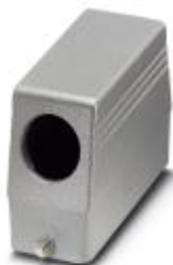
HEAVYCON sleeve housing B16, for single locking latch, height 76 mm, without support 1x M25, lateral conductor exit

Please be informed that the data shown in this PDF Document is generated from our Online Catalog. Please find the complete data in the user's documentation. Our General Terms of Use for Downloads are valid ( http://phoenixcontact.com/download )