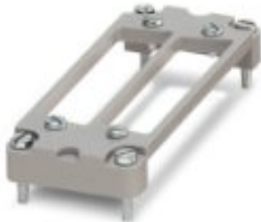
D-SUB adapter plate, for two D-SUB connectors, no. of positions 37, housing series HC-B 16...

Please be informed that the data shown in this PDF Document is generated from our Online Catalog. Please find the complete data in the user's documentation. Our General Terms of Use for Downloads are valid ( http://phoenixcontact.com/download )