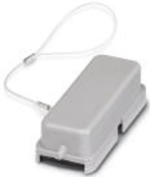
HEAVYCON protective cover, type D25, for supporting base element with single locking latch, with retaining cord, IP54, PA

Please be informed that the data shown in this PDF Document is generated from our Online Catalog. Please find the complete data in the user's documentation. Our General Terms of Use for Downloads are valid ( http://phoenixcontact.com/download )