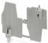
Flange cover, Length: 45.7 mm, Width: 4.5 mm, Height: 32 mm, Color: gray