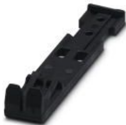
Strain relief, length: 48.7 mm, width: 9.3 mm, number of positions: 2, color: black

Please be informed that the data shown in this PDF Document is generated from our Online Catalog. Please find the complete data in the user's documentation. Our General Terms of Use for Downloads are valid ( http://phoenixcontact.com/download )