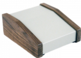
15 degree slope