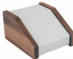
30 degree slope