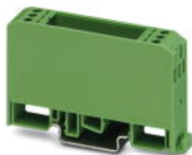
Electronic housing, with universal foot, for PCB insertion, without screw connection terminal blocks and cover

Please be informed that the data shown in this PDF Document is generated from our Online Catalog. Please find the complete data in the user's documentation. Our General Terms of Use for Downloads are valid ( http://phoenixcontact.com/download )