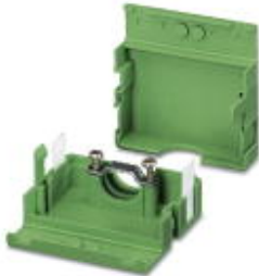
Cable housing, Pitch: 0 mm, Number of positions: 5, Dimension a: 25 mm, Color: green

Please be informed that the data shown in this PDF Document is generated from our Online Catalog. Please find the complete data in the user's documentation. Our General Terms of Use for Downloads are valid ( http://phoenixcontact.com/download )