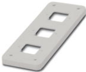
HEAVYCON adapter plate with a reinforced wall, three openings for D7 panel mounting base; type B24 on 3xD7, for panel cutouts of type B24; gray

Please be informed that the data shown in this PDF Document is generated from our Online Catalog. Please find the complete data in the user's documentation. Our General Terms of Use for Downloads are valid ( http://phoenixcontact.com/download )