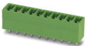
The figure shows the 10-pos. standard item

PCB headers, nominal current: 8 A, number of positions: 3, pitch: 3.81 mm, color: green, contact surface: Tin, mounting: Wave soldering