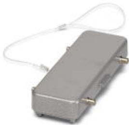
HEAVYCON protective cover, type B24, for supporting base element with double locking latch, with retaining cord, IP65, ALU

Please be informed that the data shown in this PDF Document is generated from our Online Catalog. Please find the complete data in the user's documentation. Our General Terms of Use for Downloads are valid ( http://phoenixcontact.com/download )